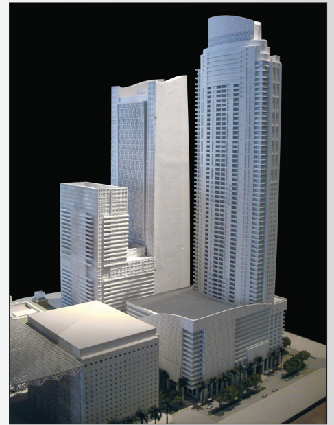
The Realization Group used the ZPrinter 310 Plus to create this 28-inch-high model of “The Met” in Miami, in one-fourth of the time and cost of traditional architectural modeling methods.

Architectural models breathe life into abstract concepts, but they have traditionally taken so long to create that clients wonder if they're waiting for an actual building to go up.