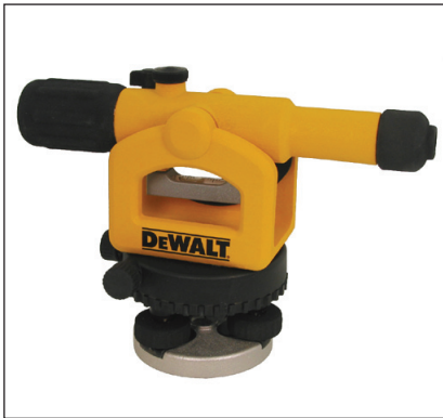
Painted 3D Systems model of a DeWALT Auto Leveling Transit