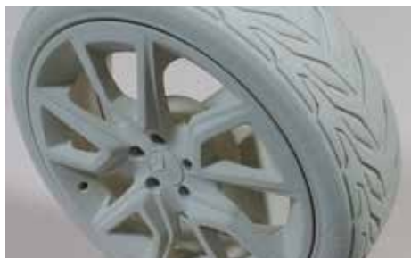
STEP 4: The first prototype of the design is created as a 3D print.