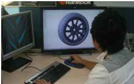
STEP 2: Working from the sketch idea, the designer develops the design in CATIA.