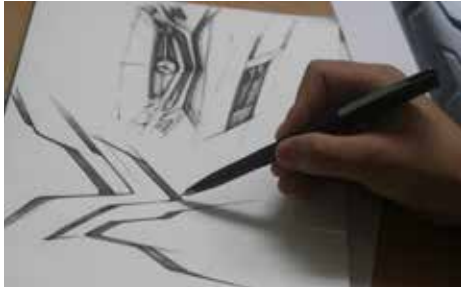
STEP 1: The designer sketches the pattern of the tire by hand.