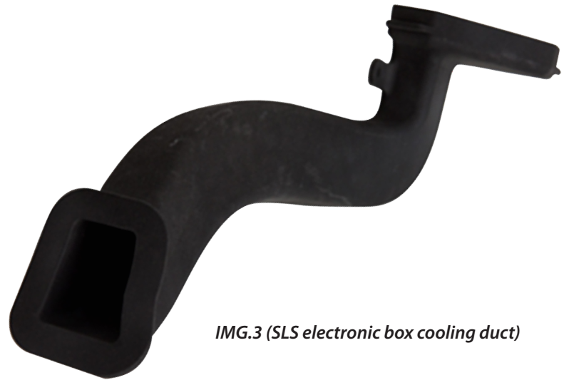
IMG.3 (SLS electronic box cooling duct)

In practical terms, Lotus F1 Team can not only test hundreds of components per month in the Wind Tunnel, but also build some race-car parts directly from digital data using CAD and SLS® technology. Designers electronically flag a design as complete and send it, along with the material selection, to the ADM Department. Using SLS, complex car components are produced in hours rather than weeks, and in some cases the part is ready for inspection before the drawing has even passed through the system.