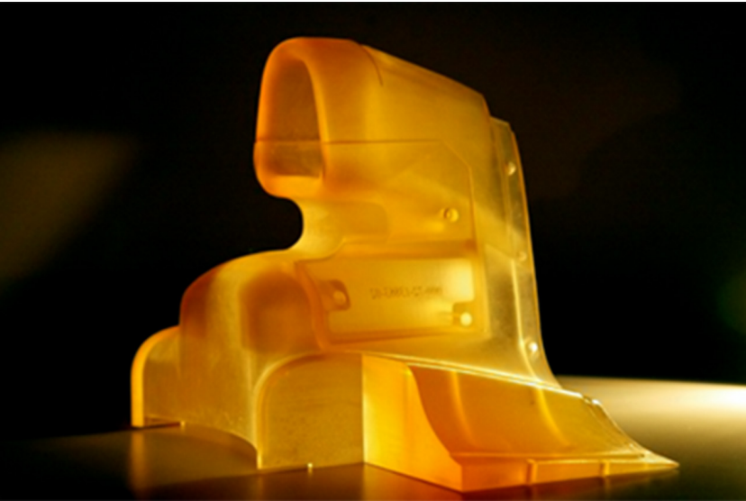
IMG.2 (Wind Tunnel model SLA Air-box)

Nicolas Hennel, Lotus F1 Team Head of Aerodynamics, explains: "Once the team got their 3D Systems machine, they began using it to develop component prototypes with a size-fit function. The use of solid imaging technology then gradually expanded from rapid prototyping to wind tunnel model manufacturing, allowing our Aero Department to grow from 11 to 80 employees. In Wind Tunnel testing, aerodynamics is an