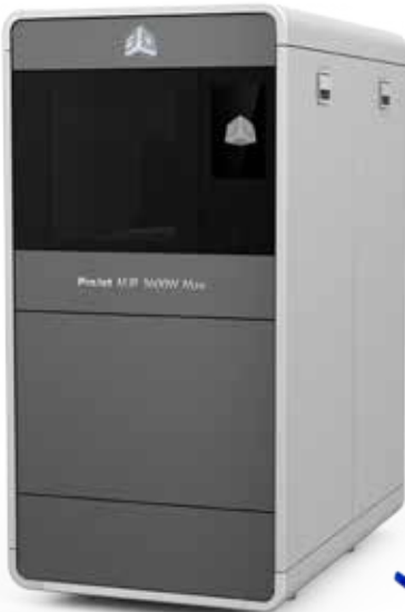
Projet MJP 3600W Series high-capacity, high throughput precision wax pattern 3D printer

Print sharp edges, extreme crisp details and smooth surfaces with high fidelity, ideal for intricate precision metal parts manufacturing with reduced metal hand polishing.