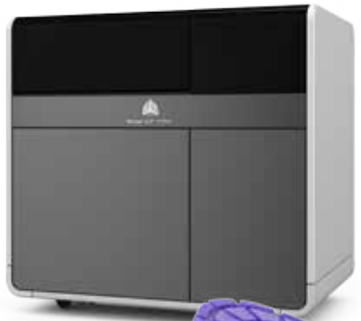
Projet MJP 2500W fast and affordable precision wax patterns 3D printer

With 3.7X or more larger build volume capability than similar class printers for broader applications versatility and 24/7 operation, Projet MJP wax printers' high productivity means fast amortization and high return on investment.