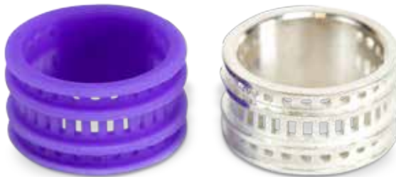
Ring printed in Visijet M2 CAST and cast

Warranty/Disclaimer: The performance characteristics of these products may vary according to product application, operating conditions, material combined with, or with end use. 3D Systems makes no warranties of any type, express or implied, including, but not limited to, the warranties of merchantability or fitness for a particular use.