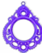
Visijet M3 CAST