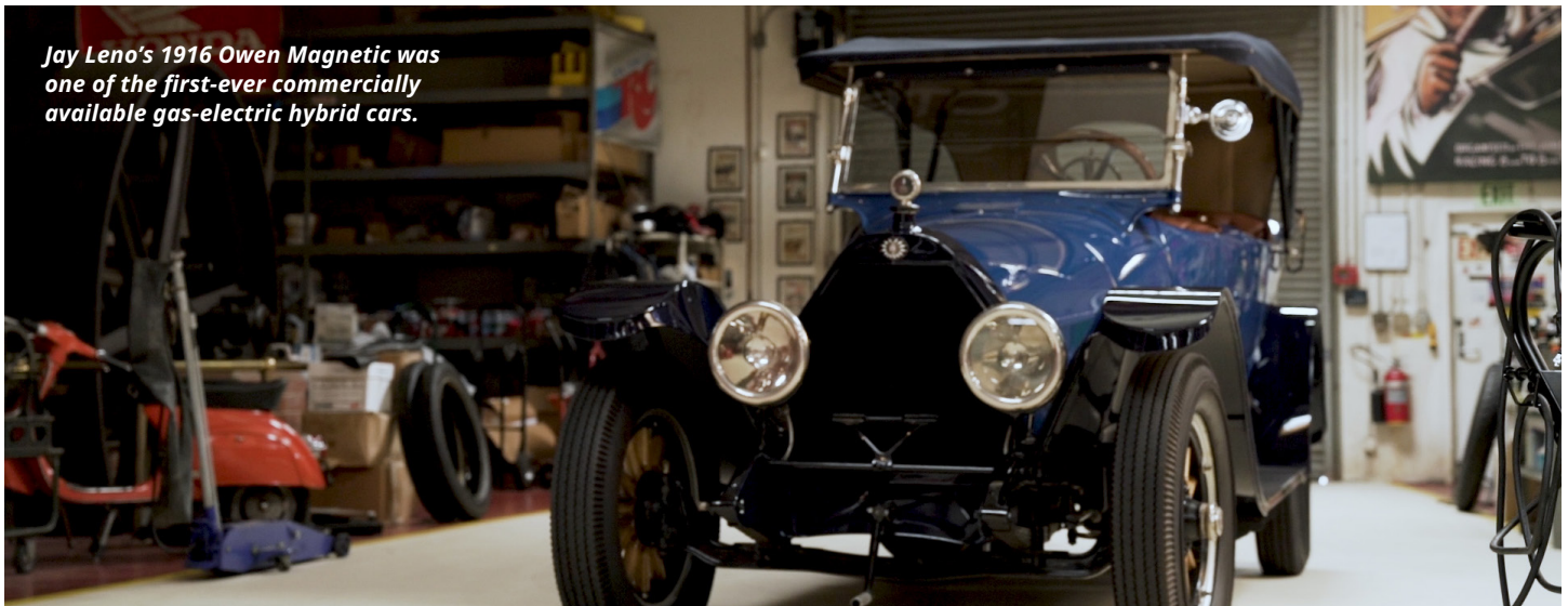
Jay Leno's 1916 Owen Magnetic was one of the first-ever commercially available gas-electric hybrid cars.

3D Systems' scan-to-CAD workflow and On Demand Manufacturing services help restore hundred-year-old car accurately and cost-effectively