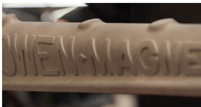
An SLA QuickCast pattern of the new valve cover was printed by 3D Systems On Demand Manufacturing and cast in aluminum.

"Our SLA 3D printing offers the highest accuracy of any 3D printing process," said Cyle Caplinger, Regional Sales Manager for 3D Systems. "Since our SLA support structures can be torn away rather than dissolved, 3D Systems SLA requires minimal post-processing and produces an excellent surface finish which results in impeccable casting patterns."