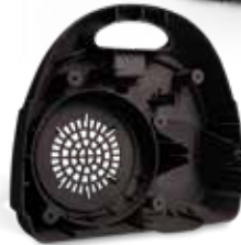
Back cover of vacuum cleaner printed in DuraForm EX Black