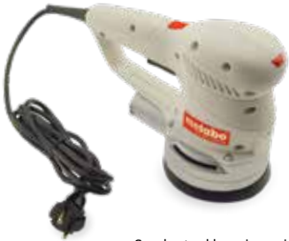
Sander tool housing printed in DuraForm PA material