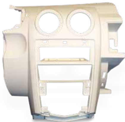
DuraForm PA Dashboard