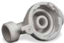
Hose fitting printed in DuraForm ProX GF