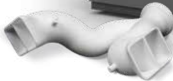
Manifold printed in DuraForm ProX FR1200