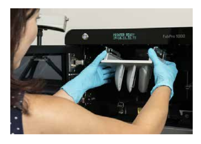
This desktop powerhouse packs industrial durability and reliability into a rugged yet compact platform.

FabPro 1000 will help shepherd the manufacturing process as ideas are validated and brought to production. FabPro 1000 assists engineers in creating accurate, functional prototypes that look and perform like final products. This makes it easier to verify the design, fit, function, and manufacturability before investing in expensive tooling and moving into production, when the time and cost to make change becomes burdensome. FabPro 1000 will quickly deliver functional prototypes for real-life testing to assess how a part will function when subjected to its expected usage.