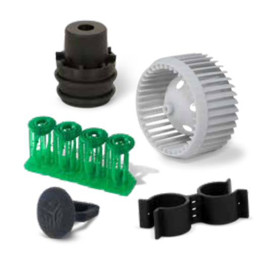
From tough and flexible engineering plastics to elastomeric or castable materials, the FabPro ^{\text{TM}} materials are designed for accuracy and quality.

From initial concept models to engineering, validation, and finally production, the industrial-grade FabPro 1000 desktop 3D printer enables rapid manufacturing of parts to meet your product design and development needs. Ideal for engineering and jewelry applications, the FabPro 1000 excels at low-volume, small-part prototyping and direct 3D production across a range of materials, producing high-quality parts with lightning speed, remarkably low operating costs and unsurpassed ease of use.