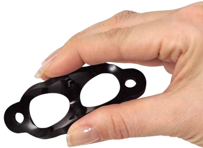
FabPro Elastic BLK is a material suited for the prototyping and design of a wide variety of elastomeric parts.

FabPro Elastic BLK material expands the range of functional materials for 3D Systems' most affordable industrial 3D printer, the FabPro 1000. Rugged and durable, the FabPro 1000 is designed for engineers and designers who want to save time and money by managing their design and prototyping processes in-house. Design iteration is quick and easy with results within hours, not days that can occur with costly outsourcing to a third-party.