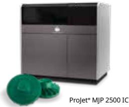
ProJet® MJP 2500 IC

Building productivity and new manufacturing efficiencies with tool-less 3D printed casting pattern production from 3D Systems