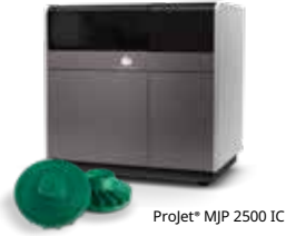
ProJet® MJP 2500 IC

Building productivity and new manufacturing efficiencies with tool-less 3D printed casting pattern production from 3D Systems