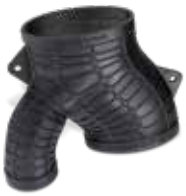
Figure 4 elastomeric materials are ideal for the production of functional rubber-like parts with excellent shape recovery, high tear strength, great for compressive applications and material malleability