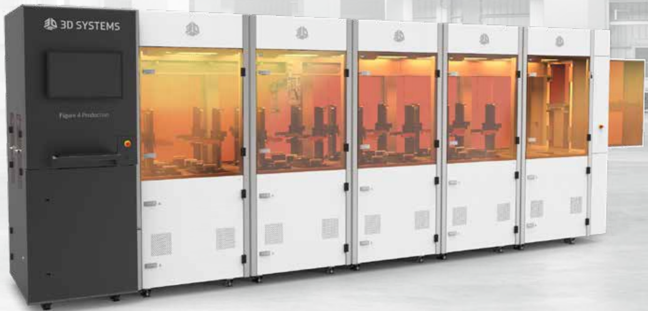
Figure 4 Production combines the design flexibility of additive manufacturing in configurable, in-line production cells to deliver a customizable and automated direct 3D production solution.

Industry's first customizable, fully-integrated factory solution for direct digital production