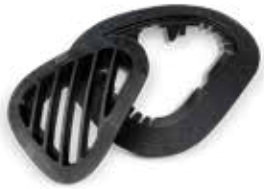
Figure 4 rigid materials produce durable plastic parts with the look and feel of cast urethane or injection molded parts, with features that include fast print speeds, high elongation, exceptional impact strength, humidity/moisture resistance, long-term environmental stability and more.