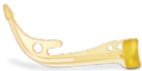
Figure 4 Production is compatible with 3D Systems' entire portfolio of NextDent® materials to facilitate full customization of dental devices. You can also choose from Figure 4 specialty materials for sacrificial tooling, jewelry casting, medical applications requiring biocompatibility and/or sterilization, and more.

See material selector guide and individual material datasheets for specifications on available materials.