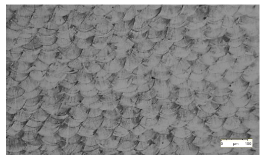
Microstructure after stress relief